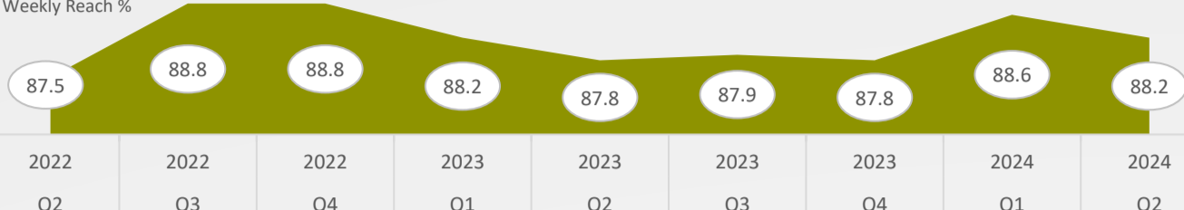
Weekly Reach %

88% of the population* tune in to radio every week